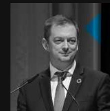
ANDREW PARSONS PRESIDENT, INTERNATIONAL PARALYMPIC COMMITTEE