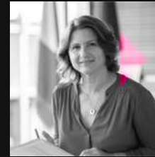
ROXANA MARACINEANU MINISTER DELEGATE IN CHARGE OF SPORTS