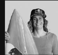
JUSTINE DUPONT PROFESSIONAL SURFER