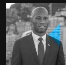
DIDIER DROGBA VICE-PRESIDENT, PEACE & SPORT