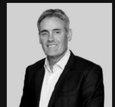
SIR RUSSEL COUTTS CHAIRMAN AND FOUNDER, SAILGP