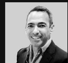
YOURI DJORKAEFF FIFA FOUNDATION CEO