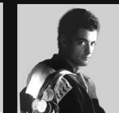
MATT BIONDI OLYMPIC LEGEND