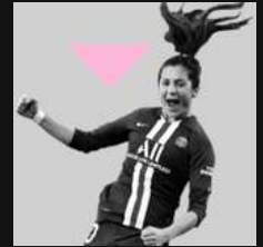
NADIA NADIM PROFESSIONAL FOOTBALL PLAYER PSG