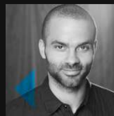
TONY PARKER FORMER NBA PLAYER & ENTREPRENEUR