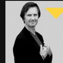
MATT CLIFFORD MUSICIAN, ROLLING STONES